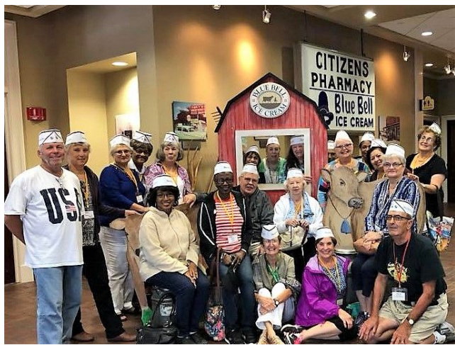
Trip to George Bush Library