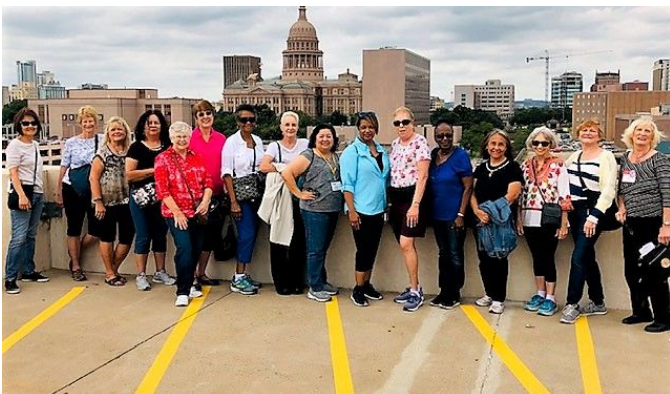
Roll and Stroll Group explored the Waller Creek Development on August 28, 2018