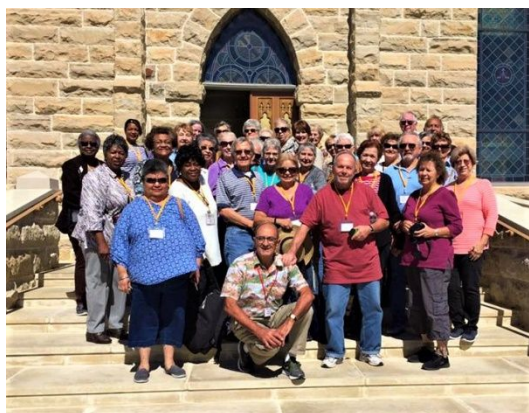
Members enjoyed a tour of the painted churches on October 24.

Savings $25.00 Checking $2213.14 Travel $2907.46