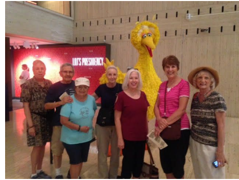
Roll and Stroll Visit to the LBJ library